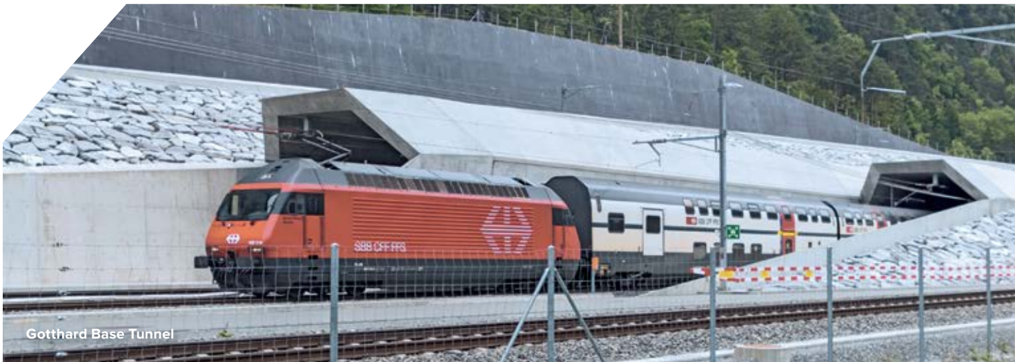
Gotthard Base Tunnel