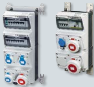
1 AMAXX® tunnel receptacle combination