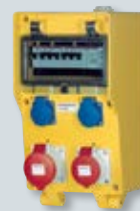
3 EverGUM® tunnel receptacle combination