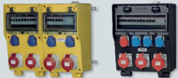
Products made of AMELAN®