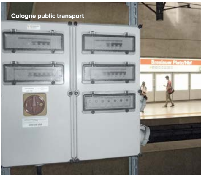
Cologne public transport