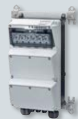
4 AMAXX® tunnel power distributor